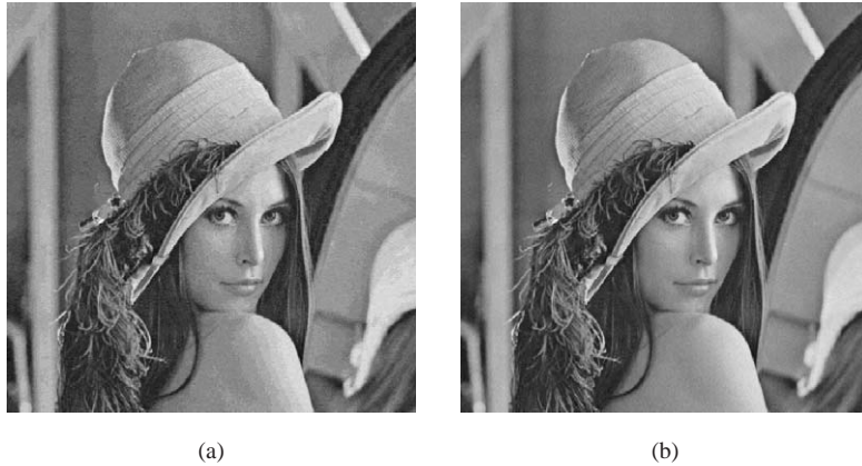
Fig. 3. Stego-images obtained by (a) Simple LSB-substitution method; (b) proposed method, where the secret-image is of size 512 \times 256 pixels (4-bit insertion).