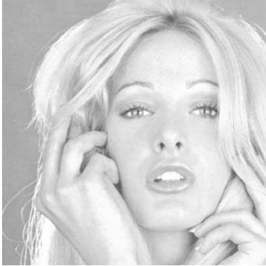
Fig. 2. Test image used as the second set of secret message.

generated grayscale images. There are two set of secret messages. The first set of secret message consists of 1000 randomly generated message of 512 \times 512 \times k bits, where k refers to the number of LSBs in the cover image pixels that are used to hold the secret data bits. For example, suppose that the last two LSBs of the cover image pixels are used to hold the secret data, then the secret data is of size 512 \times 512 \times 2 = 524\,288 bits. The second set consists of the reduced-sized images of the grayscale image ‘Tiff’ as shown in Fig. 2. The reduced-sized images are of size 512 \times 256 pixels (for 4-bit insertion), 384 \times 256 pixels (for 3-bit insertion), 256 \times 256 pixels (for 2-bit insertion) and 256 \times 128 pixels (for 1-bit insertion), respectively.